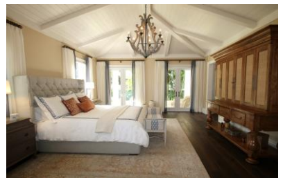
Non contractual pictures